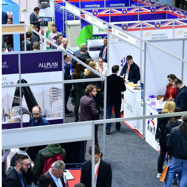
PHOTO GALLERY FROM PREVIOUS EDITIONS OF EXPOKOS FAIR